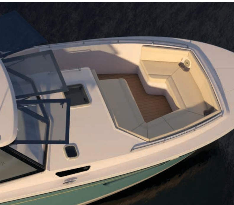
Opening electric windshields

Enjoy the spacious and secure comfort of the bow area while chatting with friends. The all-weather, all-conditions, indoor-outdoor pilothouse has all the amenities for day yachting. The galley-up design puts it right in the middle of all the action.