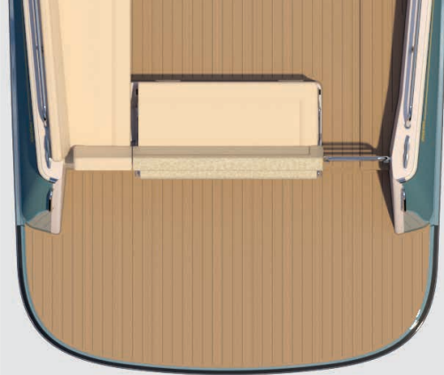
Available 2024 TWIN 440 HP VOLVO DPI