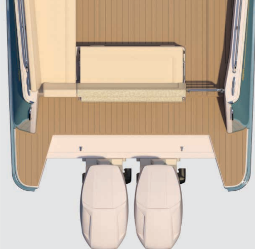
TWIN 600 HP VERADOS