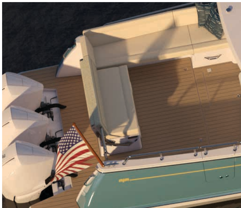
Convertible double sunlounge aft