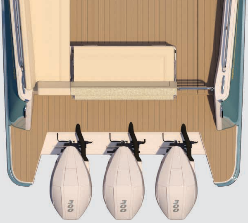
TRIPLE 300 HP VERADOS