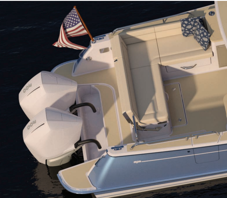
Convertible double sunlounge aft