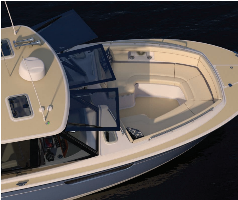
Opening electric windshields

Forward, a comfortable bow features a full sun cushioned area with an optional Mediterranean-style shade. The pilothouse provides a protected space where the captain and friends can close the generous windows and enjoy climate-control. The cockpit is a hub for entertaining with an optional grill, refrigerator, ice maker, or sink.